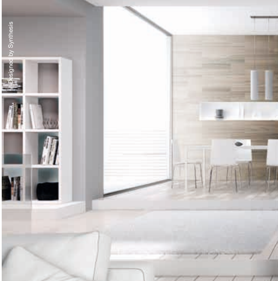
Sax Electric with led, height 1800 mm, length 395 mm. Standard White finish (cod. 01).