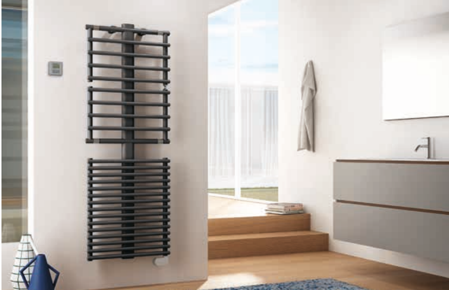
Get Up Electric, height 1499 mm, lenght 550 mm. Medium Grey finish (cod. 4D).