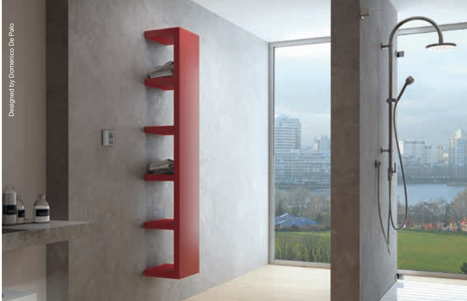
Quadraqua Electric, height 1828 mm, lenght 300 mm. Flame Red finish (cod. 7D).